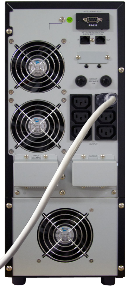
TX90i-3000 and MXIU-200