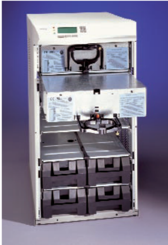
Powerware 9170+ 6-slot configuration