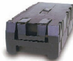
Battery Module (2 per slot)