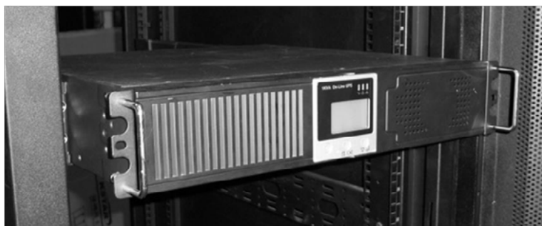
Push the UPS or EBP into the cabinet via the NXRT-RR4 from the front