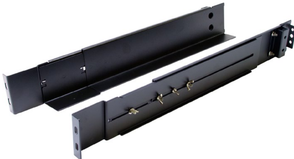
NXRT-RR4 for UPS or EBP mounting in cabinet