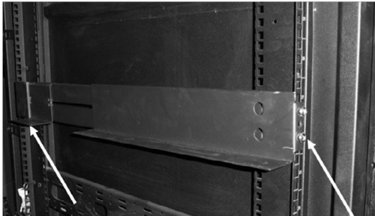
Assemble the rail onto the cabinet U-BAR with screw at front & back using moveable nuts