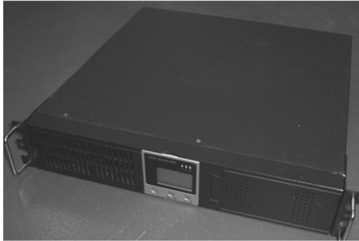
UPS front view after installing 2U ears