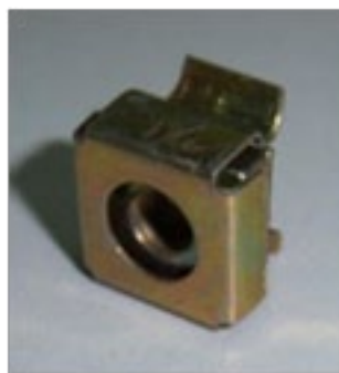
Moveable nut for mounting rail kit in cabinet