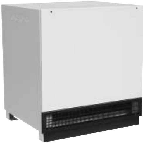
CR3 cabinet model

POWER BATTERY offers an extensive line of pre-wired and fused battery cabinets complete with UL and CUL approval. Standard and custom DC voltages complete with breakers and chargers are available.